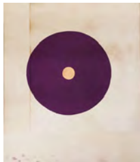
Bindu, a point or drop containing the undifferentiated absolute; Jaipur, Rajasthan, 2010 Unspecified paint on found paper 14 1/4 x 12 in. 17 x 14 in. (frame) #AT-JKG15 5