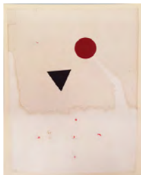
The eternal race of the feminine principle towards its masculine homologue; Chômu, Rajasthan, 2012 Unspecified paint on found paper 13 1/4 x 10 3/8 in. 17 x 14 in. (frame) #AT-JKG15 8