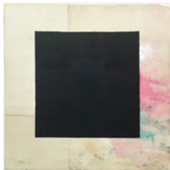
Portrait of Kali, the Goddess, the "Black One"; near Udaipur, Rajasthan, 2009 Unspecified paint on found paper 14 x 14 in. 17 x 17 in. (frame) #AT-JKG15 2