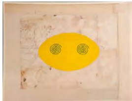
Anonymous tantric painting, "Energy's Egg; Udaipur, Rajasthan," 2001, Unspecified paint on found paper, 11 3/8 x 14 1/2 in.