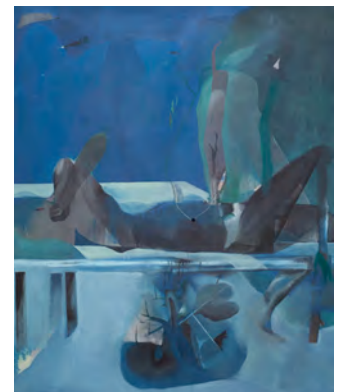
Naked with Scars , 2012, Oil on canvas, 67 x 55 in.